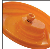
SD92SC Sealed Cover Lid